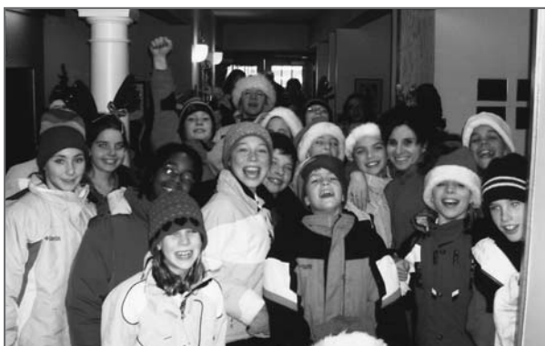
St. John's Catholic School 5th graders making deliveries to Gift of Life at Christmas time