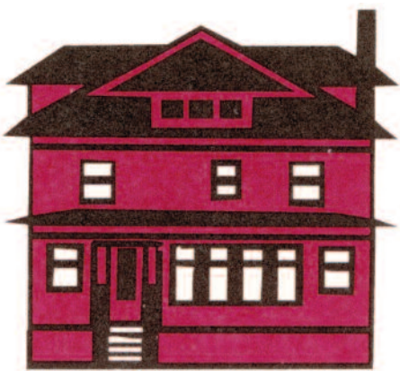
Gift of Life Transplant House Rochester, Minnesota

The mission of Gift of Life Transplant House is to provide patients and their caregivers with high quality, affordable accommodations in a supportive, home-like environment.